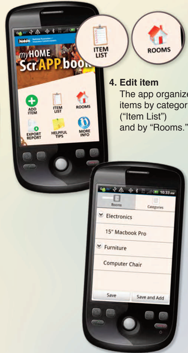
4. Edit item

Take photos of your item, then add details: name, room, category, date of purchase, price, serial number, then "Save." To add more items, click "Save and Add."