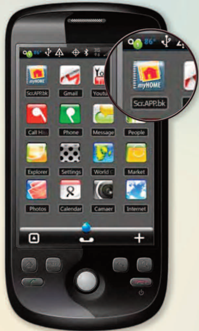
1. Launch App