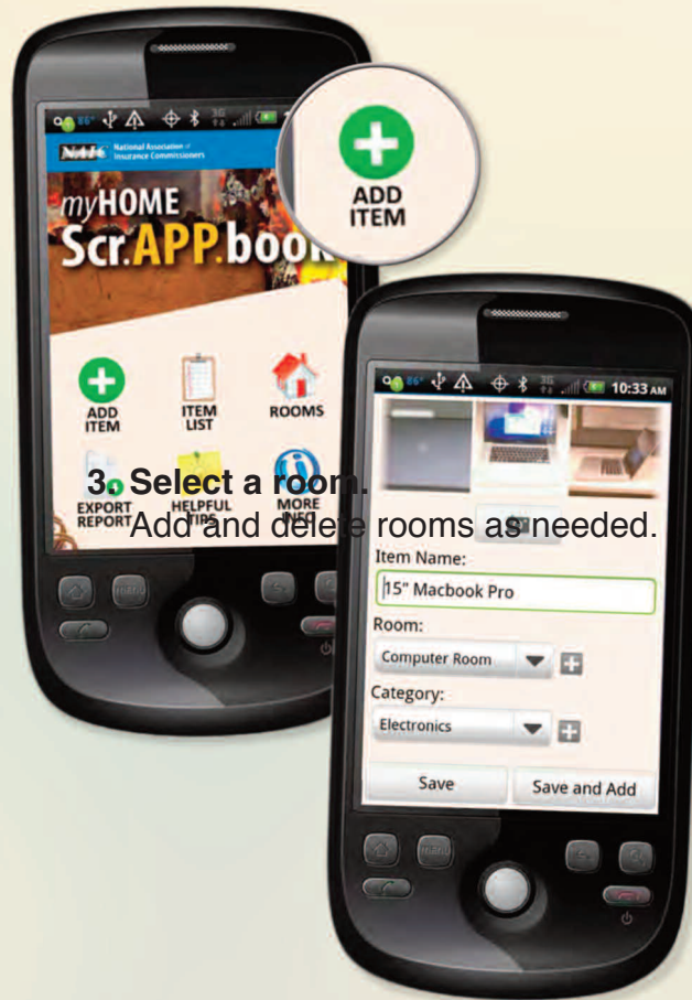
2. Add Item

Take photos of your item, then add details: name, room, category, date of purchase, price, serial number, then "Save." To add more items, click "Save and Add."